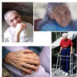
ESCLICN Giving Health a Helping Hand